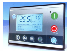
Universal Intelligent Controller