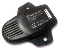
Temp. & Humidity Sensor