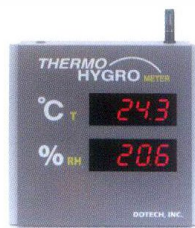
Temp & Humidity Controller